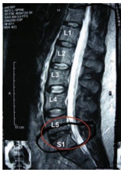
Figure 1b: Post-treatment MRI (14/03/05)