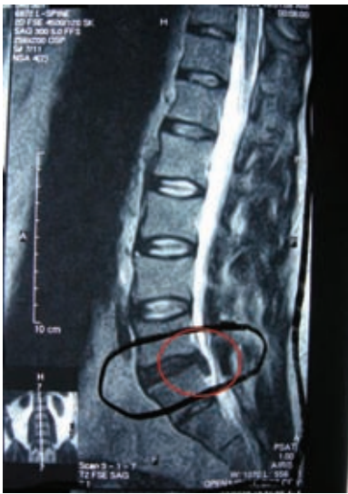
Figure 1a: Pre-treatment MRI (02/02/05)